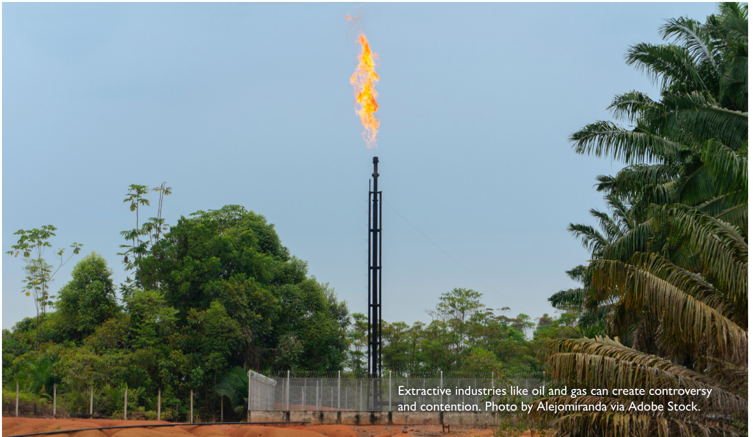
Extractive industries like oil and gas can create controversy and contention.

These fundamental challenges are some of the main sources of the unresolved dilemmas that animate the actions of environmental defenders. They present diverse opportunities for substantive engagement with environmental defenders—especially women, Indigenous leaders, and marginalized groups—to help bring attention and facilitate constructive responses to these recurrent areas of concern.