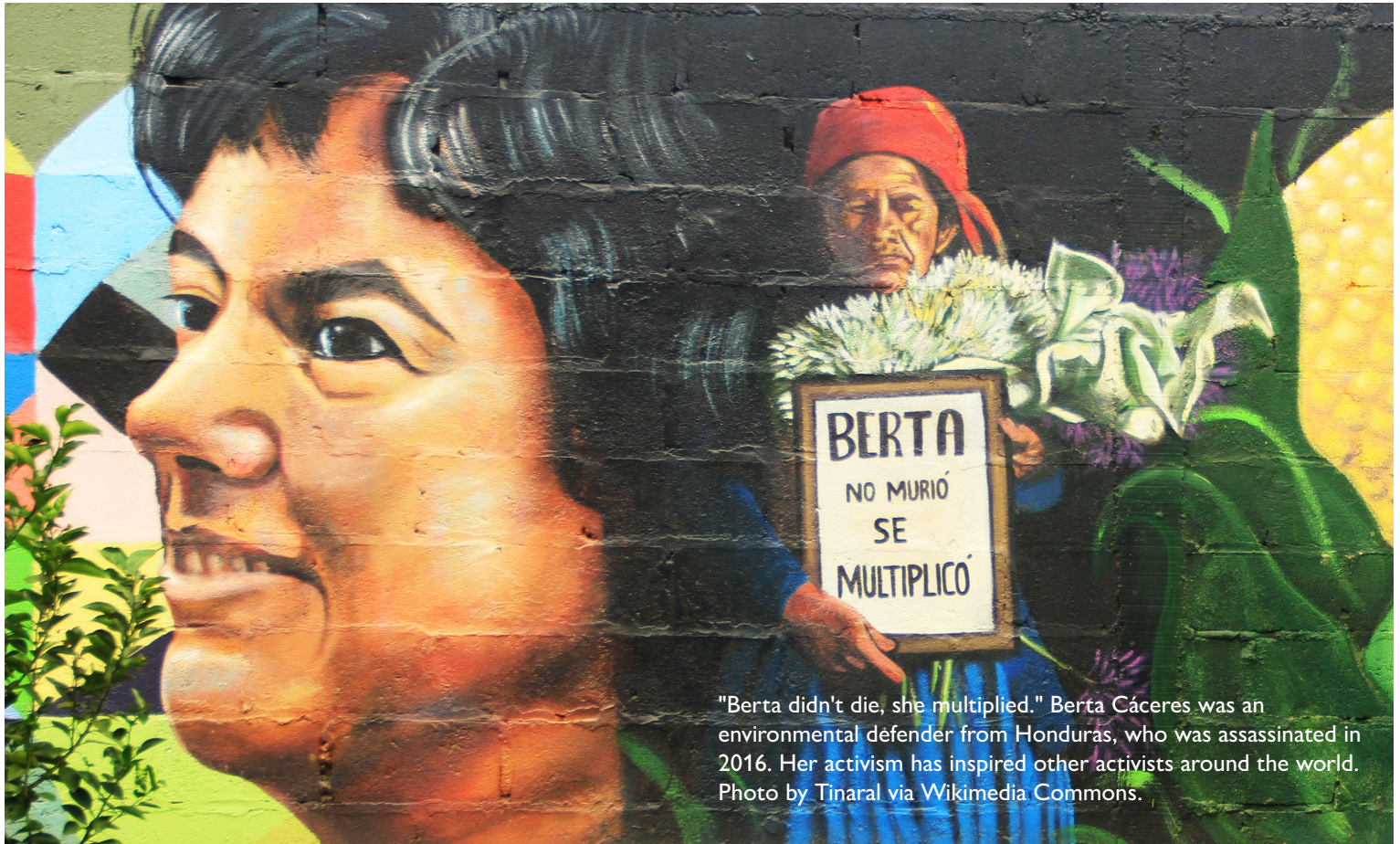
"Berta didn't die, she multiplied." Berta Cáceres was an environmental defender from Honduras, who was assassinated in 2016. Her activism has inspired other activists around the world.

environmental defenders has been unfolding in dozens of countries around the world. Although the problem is especially prevalent in Latin American countries such as Colombia, Mexico, Honduras, and Brazil, there are also many examples from Asia (Philippines, Cambodia, India, Burma, and Bangladesh) and Africa (Democratic Republic of the Congo and Tanzania).