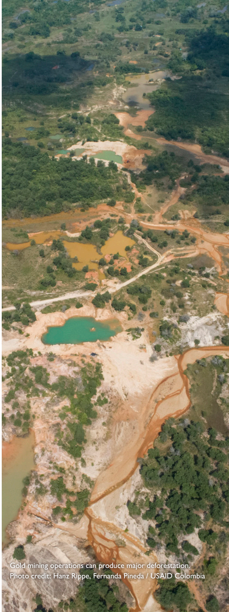
Gold mining operations can produce major deforestation.

Additionally, USAID is working with the Government of Colombia to collect the cadaster of the Chiribiquete National Park to close its boundaries, protect it from further illegal activity, and identify deforestation hotspots with accurate imagery and information. The piloting of two land use contracts for conservation in the surrounding areas of the park are also expected to strengthen the protection of environmentally protected areas, while giving small peasants the formal right to use the land in environmentally friendly livelihood activities in coordination with the state.